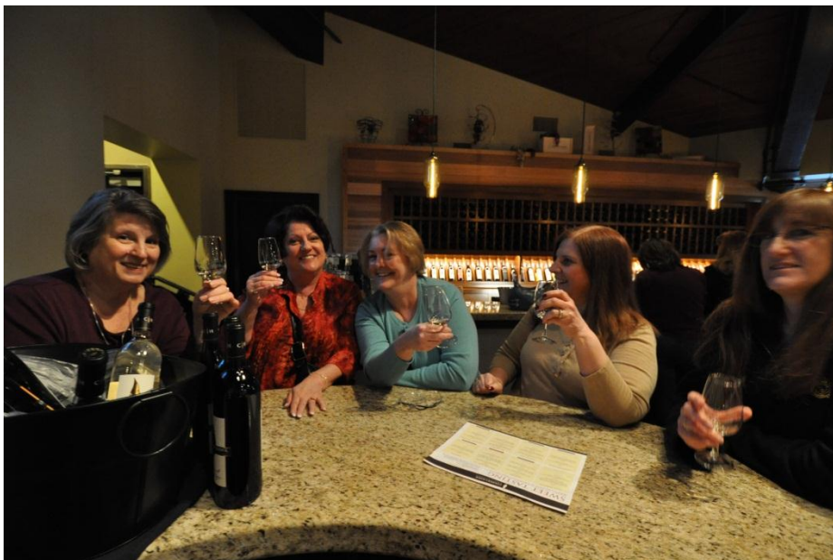
The "Sweet" Tasting Crew enjoying one of the many sweet treats.