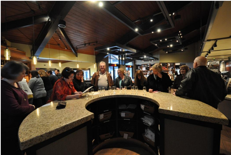
Choosing between the various tasting menus.

It has been a while since we gathered to taste some of the fruits of the vine so twelve adventuresome Tritons traveled to a new venue, Cooper's Hawk in Arlington Heights (in the old Pappadeux space). What a great way to lighten up the winter doldrums!