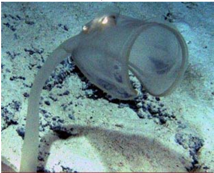
Submarine discovers new animals off Australia WHAT LIES BENEATH

A DEEP sea submarine exploration off Australia's southern coast has discovered new species of animal (see photo above).