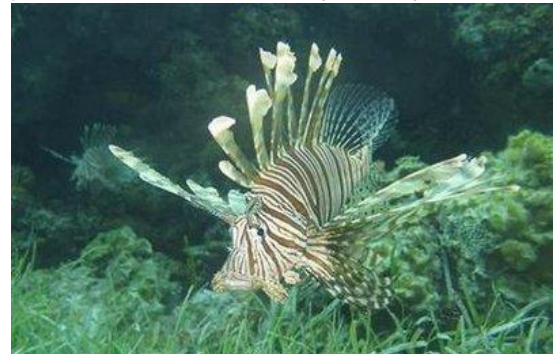
A lionfish is pictured in the waters near Miami Florida.

"They can be quick over a short distance, but they're not a free-swimming ocean fish like a tuna or a mackerel," he said.