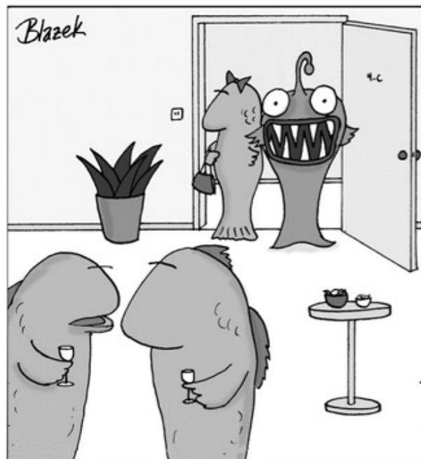
"Now don't anybody say anything. Here comes Karen with her new boyfriend from below 15,000 feet."