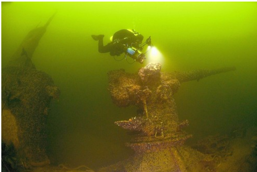
(AFP/Getty photo by Stefan Hogerborn / June 9, 2009)

Reprinted from http://www.chicagotribune.com/features/chi-pod-pix,0,6615505.photogallery