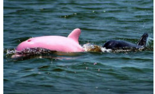
Pink dolphin: Conservationists are warning people to leave uniquely colored animal alone.

Capt Rue originally saw the dolphin, which also has reddish eyes, swimming with a pod of four other dolphins, with one appearing to be its mother which never left its side. He said: "I just happened to see a little pod of dolphins, and I noticed one that was a little lighter. It was absolutely stunningly pink."