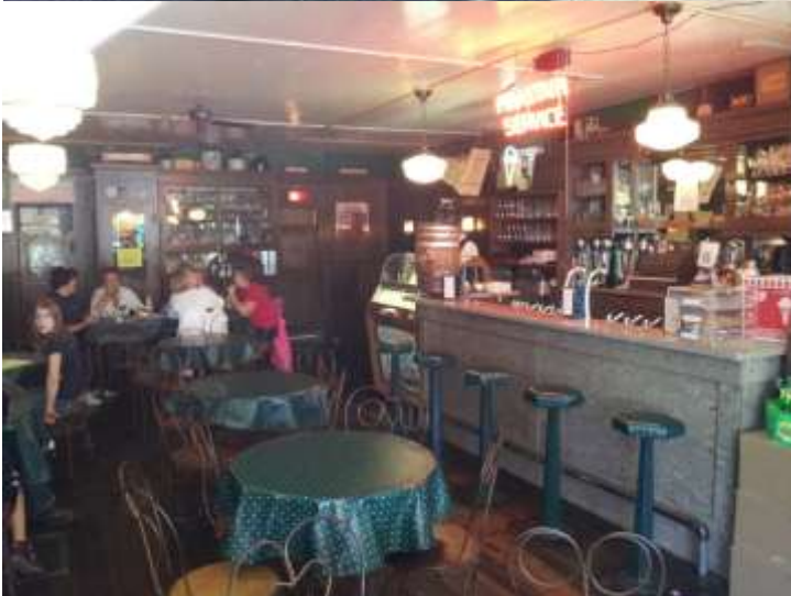
TIC: Jim Hynan

We all agreed it was a great day to be out in the country, kick back and remind ourselves what life was like not that long ago but we all really appreciate our modern conveniences.