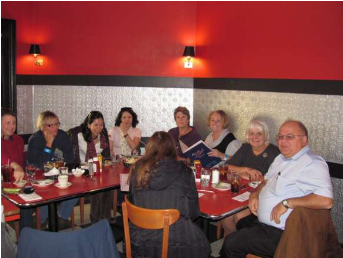
Recapping our experience at the Museum and enjoying some great Jewish food at the Bagel.