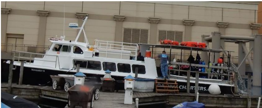
SeaQuest II (seats 16 divers)

TIC: Scott Reimer / mobile: 847-561-2272 / email: streimer1@comcast.net