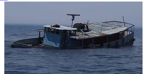
M V Buccaneer