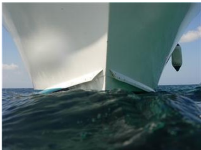
Last Year's 1 st Place – Steve Leibovitz

Have you voted yet? You need to select your top three choices in the annual Triton Photo/Video Contest? Don't delay, your ballots must be in before Sunday, January 22.